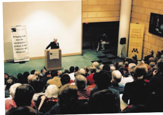
Father Richard John Neuhaus