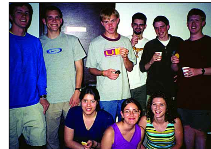
Students in our New Testament course loved the free refreshments!